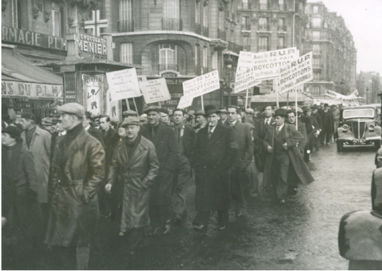
Figure 2: Marchers supporting the boycott of Japanese goods sponsored by the RUP.

the governments of the “peace loving powers” to “put an end to Japanese aggression on China by economic measures, in particular by excluding from their territory all Japanese goods” (RUP, 15-16 décembre 1937). By the following spring there was cause for optimism. In the US, Woolworth’s stopped carrying Japanese products, as did all retail outlets in Montreal, Quebec. Meanwhile, exports of Japanese silk had fallen precipitously and, overall, a six per cent drop in Japanese exports had taken place (RUP, 25 March 1938 and IPC, (1938c): 8)