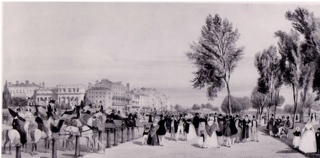
Fig 3 Thomas Shotton Boys, View of Hyde Park near Grosvenor Gate, 1842.